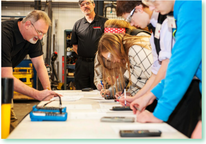
TC3 College Physics working with Raymond® engineers in the test lab