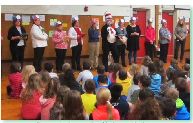
Greene Primary Staff pictured above

It was a wonderful performance, connecting our Arts in Education theme, learning dance through different cultures, to the St. Patrick's Day Holiday.